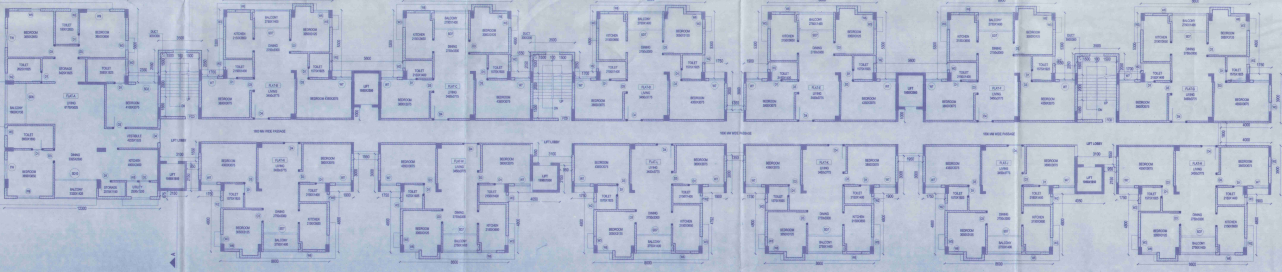
TYPICAL FLOOR PLAN (2ND, 3RD, 4TH, 5TH, 6TH, 8TH, 9TH AND 10TH) SCALE: 1:100