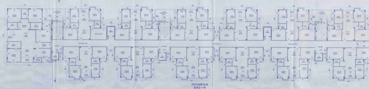
7TH FLOOR PLAN SCALE:1:100